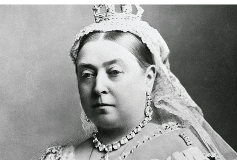
Hey, who is this gal?